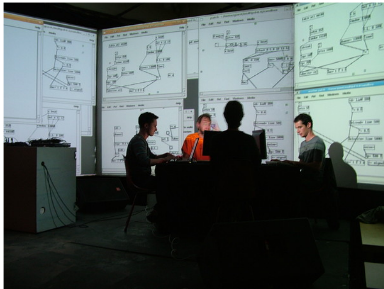
Pd~graz performing blind date in Montreal